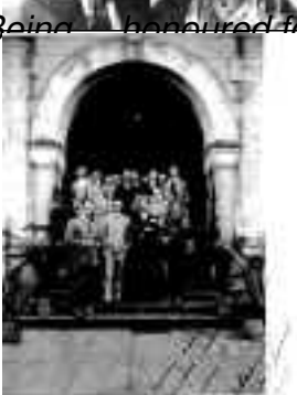
Being honoured for the great achievement, at the Government Palace in São Paulo. At the center