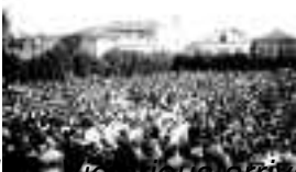
From the walls of the Church of Our Lady of Sponsorship in Jaú. The man taking a photogr